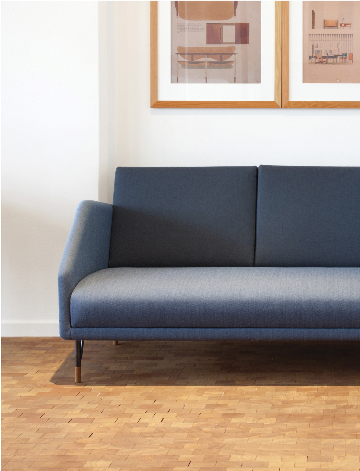
53 SOFA 1953 BY FINN JUHL